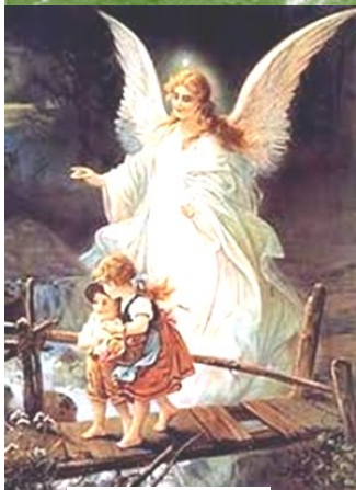
Holy Angels, Pray for us!